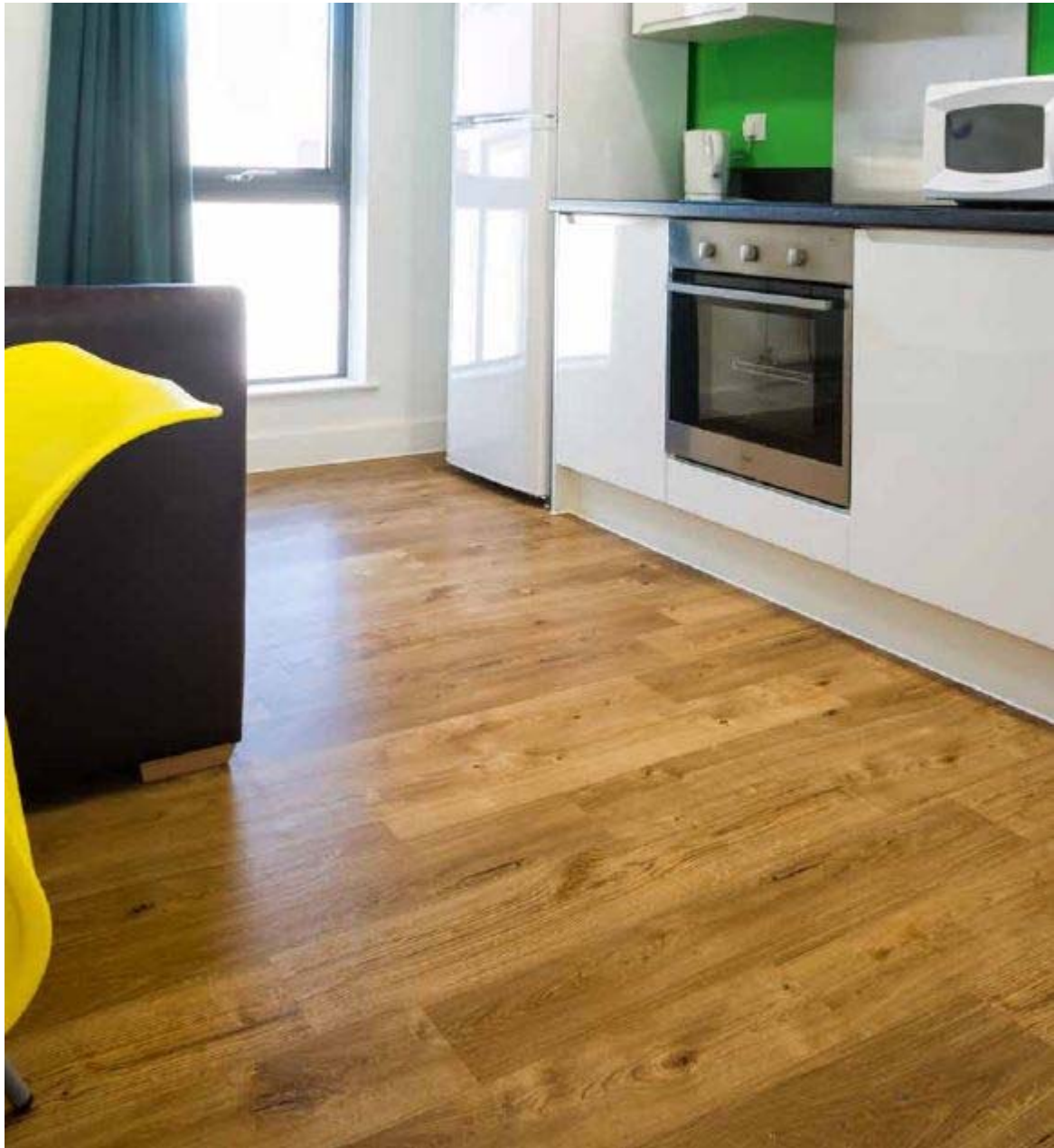
Fig1 Image of product